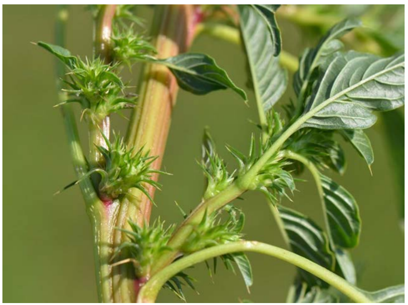
Figure 2. Spiny bracts such as these to positively identify Palmer amaranth.