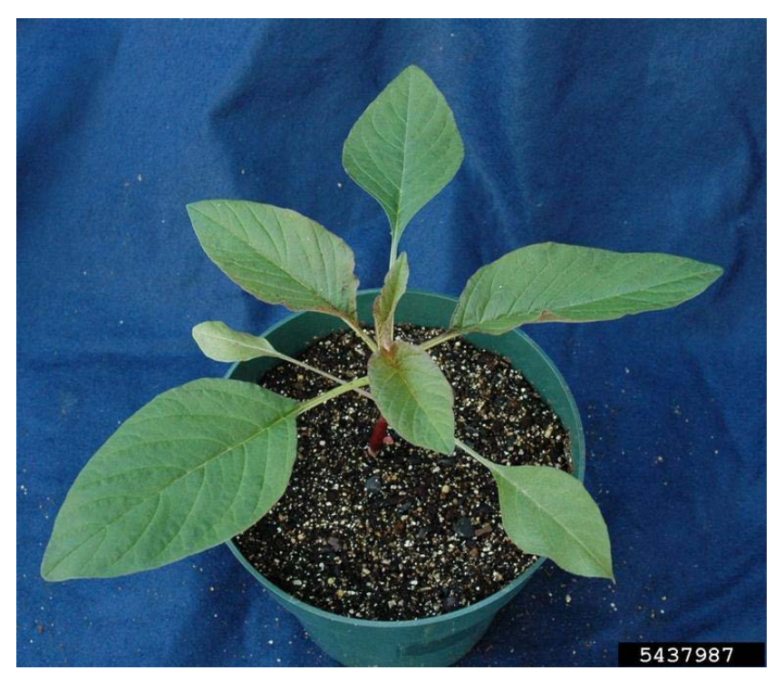
Figure 1. Young Palmer amaranth plant.