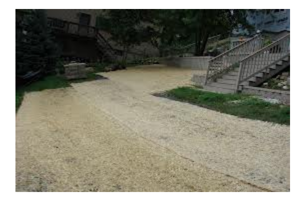
Erosion control blanket with straw on slope

Erosion control mats (or blankets) are manufactured products with chopped straw, wood fibers, or coconut fibers between layers of jute or UV degradable plastic netting. They are designed for a variety of applications depending on slope, water velocity, longevity and desired vegetation. They come in a variety of widths lengths and mulch densities depending on the manufacturer. When used in applications where vegetation is established from seeds the seeds are planted and the erosion control mats are applied over the seeded area. Erosion control mats need to be overlapped and anchored with wire staples as per manufacturer's specifications. These are effective for erosion control on moderate to steep slopes.