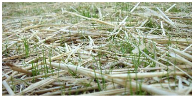
Grass seedlings emerging through straw mulch

Straw and wood fibers (wood chips) are the most common materials applied as loose mulch. Both materials are easy to find at retail stores and landscape supply companies and relatively inexpensive.