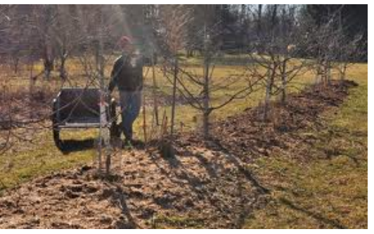
Wood chip mulch around trees

Applying straw or wood fiber mulch directly to soil may limit nitrogen availability. Refer to Conservation Job Sheet 484 "Mulching" for directions on supplemental nitrogen.