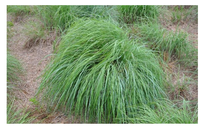
Coastal Plains Germplasm little bluestem at the ETPMC

Schizachyrium scoparium (Michx.) Nash var. scoparium