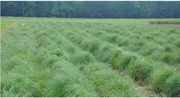
Coastal Plains Germplasm production field at the ETPMC

Seed production fields of Coastal Plains Germplasm can be started from transplants or direct seeding. Transplants are the fastest establishment method and allow the use of pre-emergent herbicides; limiting competition from weedy annual species during early establishment. Fields started from seed will require a longer establishment period. Flail-Vacs or similar seed stripper are the preferred method of harvest. Coastal Plains Germplasm is indeterminate and genetically diverse with plants