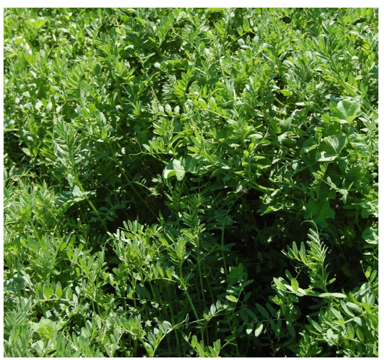
Common vetch, 165 days after planting, Lockeford PMC.