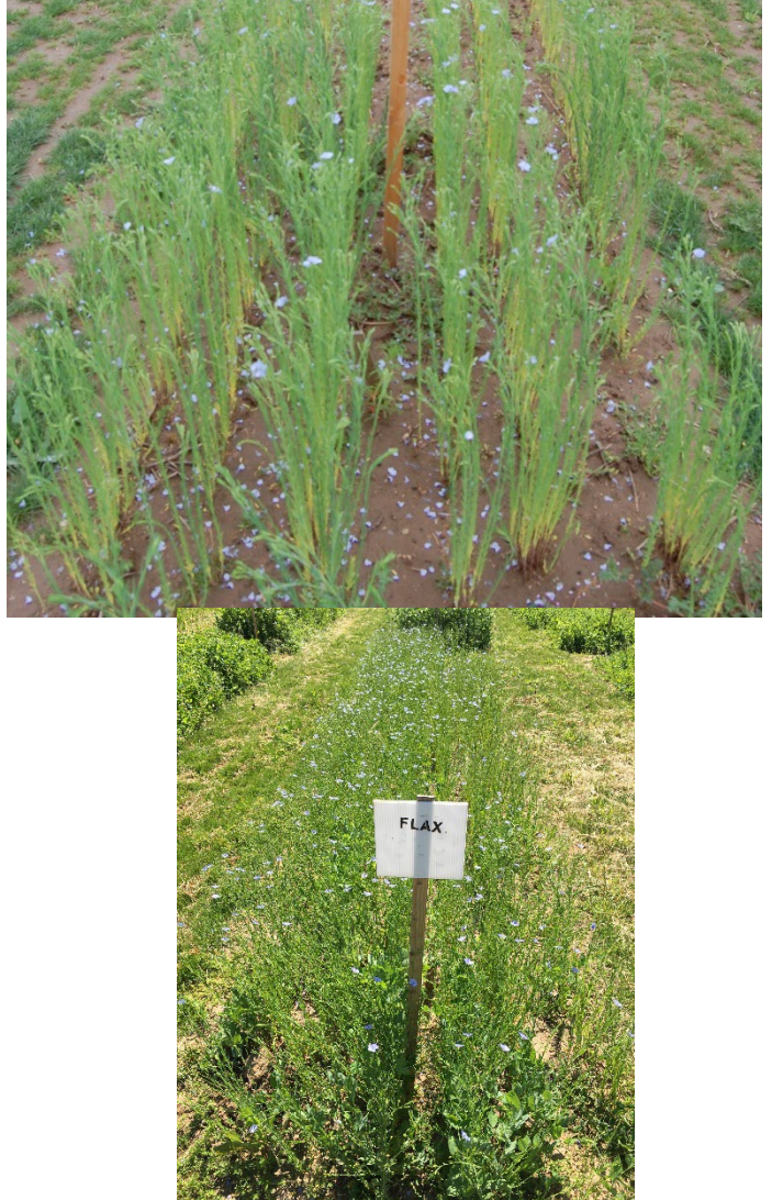
Flax, Lockeford PMC.

Plant Guide for Common Flax (Linum usitatissimum L.)