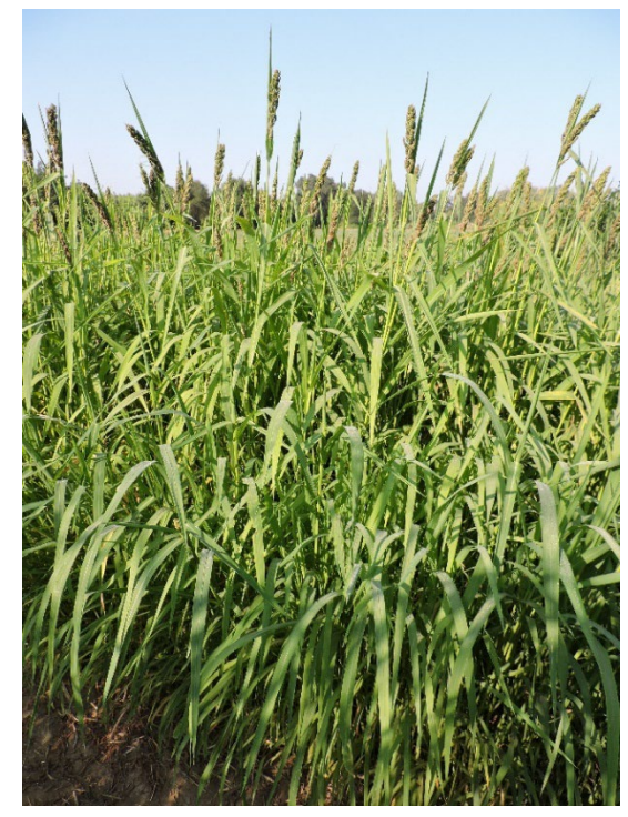
Japanese millet, Lockeford PMC.