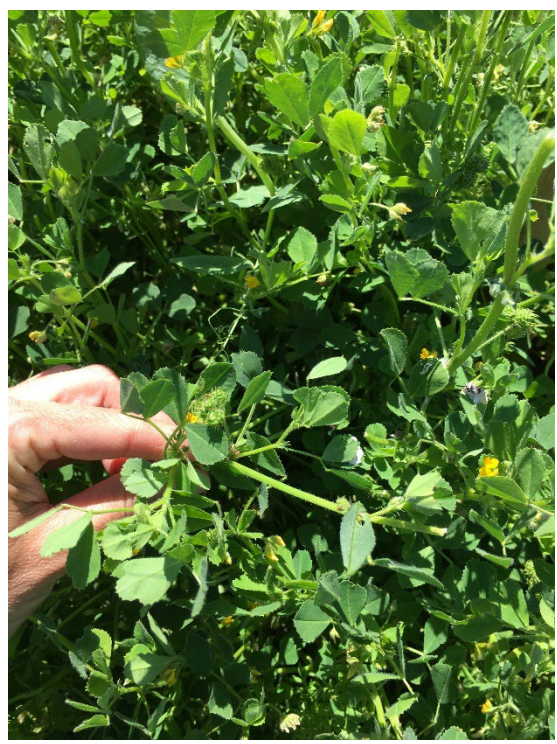
Barrel Medic (Sultan), Lockeford PMC.