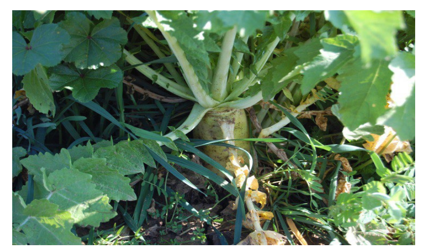
Mature radish plant showing large tap root, Lockeford PMC.