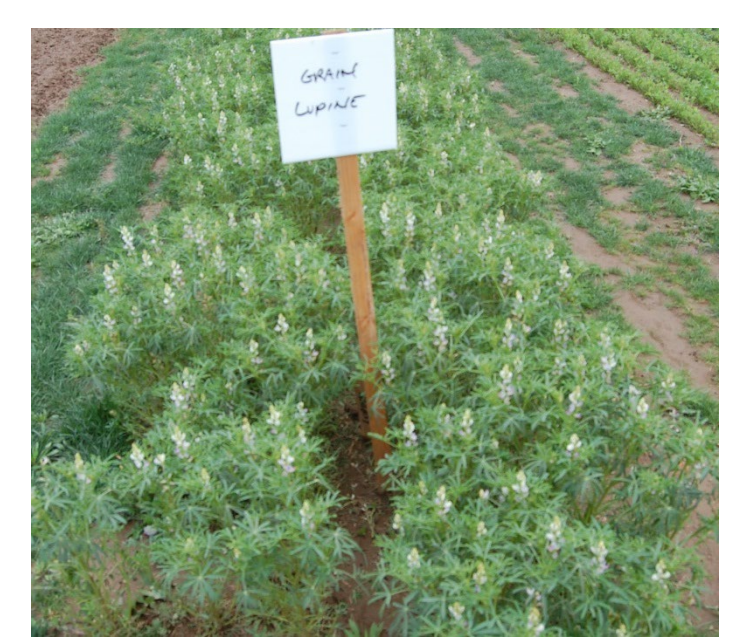
Grain Lupine Lockeford PMC.