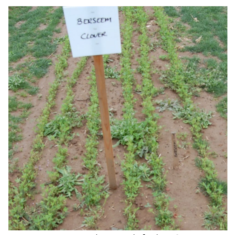
Berseem clover, Lockeford PMC.