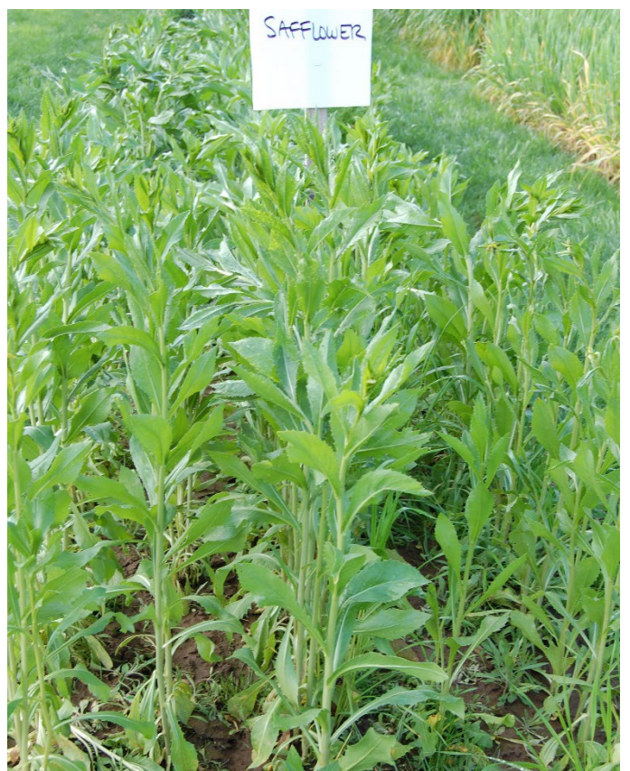
Safflower, Lockeford PMC.

https://ipmdata.ipmcenters.org/documents/cropprofiles/Safflower%20Crop%20Profile%203-1-2016%20MB.pdf