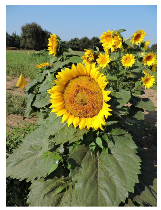
Sunflower (black), Lockeford PMC.

http://ipm.ucanr.edu/PMG/GARDEN/FLOWERS/sunflower.html