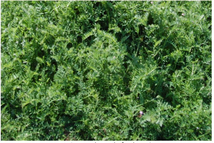
Hairy vetch, Lockeford PMC.

<u>UC SARAP Cover Crop database</u> <u>https://plants.usda.gov/home/plantProfile?symbol=</u> <u>VIVIV8</u>