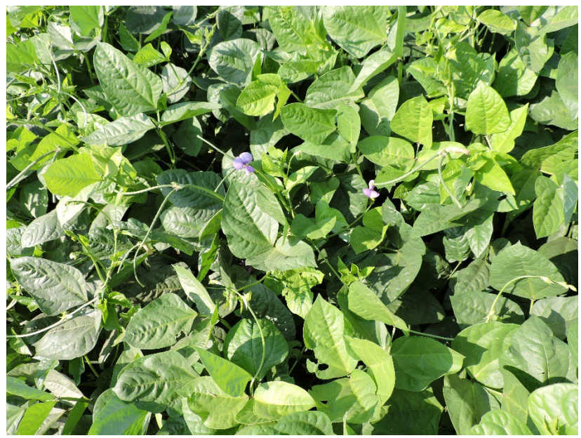
Cowpea (Red Ripper), at Lockeford PMC.

<u>UC SARAP Cover Crop database</u> <u>https://plants.usda.gov/home/plantProfile?symbol=</u> <u>VIUN</u>