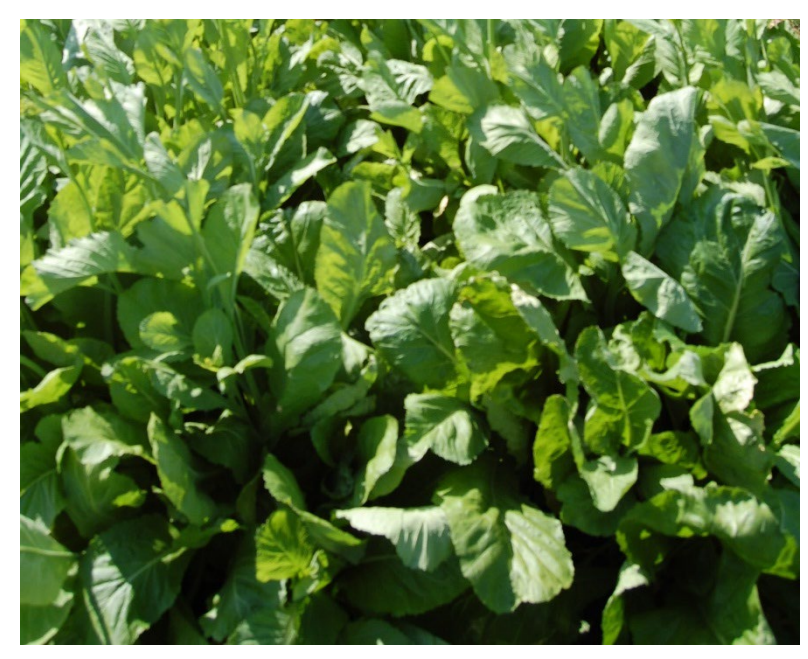
Oriental mustard, Lockeford PMC.

<u>UC SARAP Cover Crop database</u> http://covercrops.cals.cornell.edu