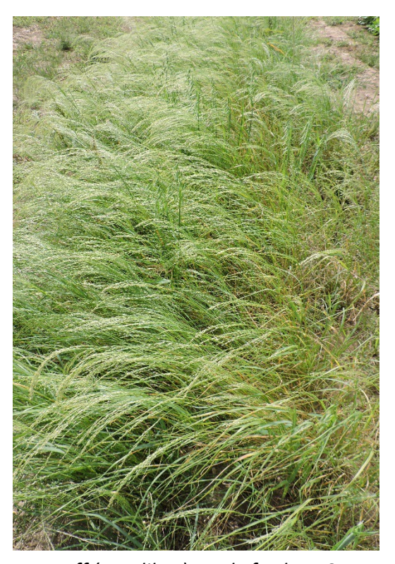
Teff (Excalibur), Lockeford PMC.

http://eol.org/pages/1114367/overview http://covercrops.cals.cornell.edu/Teff.php