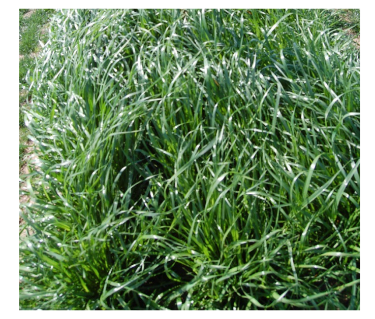
Common annual ryegrass, Lockeford PMC.