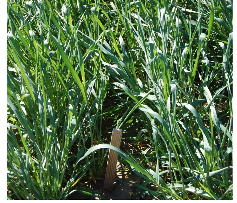
Triticale (Juan) 120 days after planting, Lockeford PMC.

http://www.advancecovercrops.com/portf olio_item/triticale/