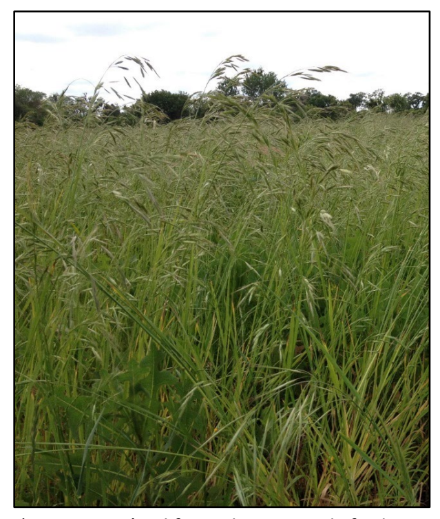
'Cucamonga' California brome, Lockeford PMC.

<u>'Cucamonga' California brome release brochure</u> <u>UC SARAP Cover Crop database</u>