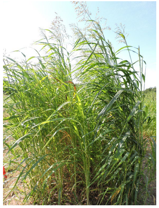
Sudangrass (Piper), Lockeford PMC.