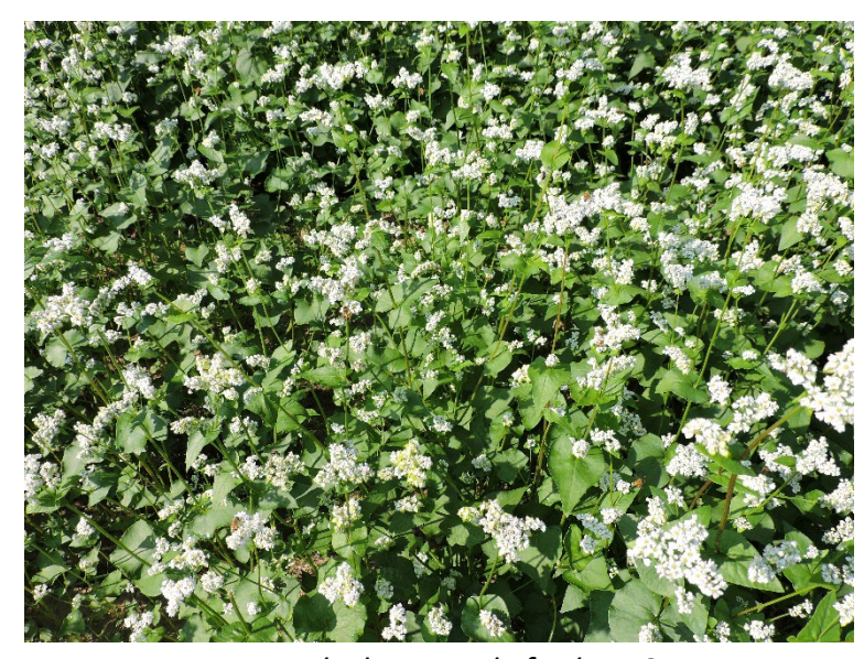
Buckwheat, Lockeford PMC.