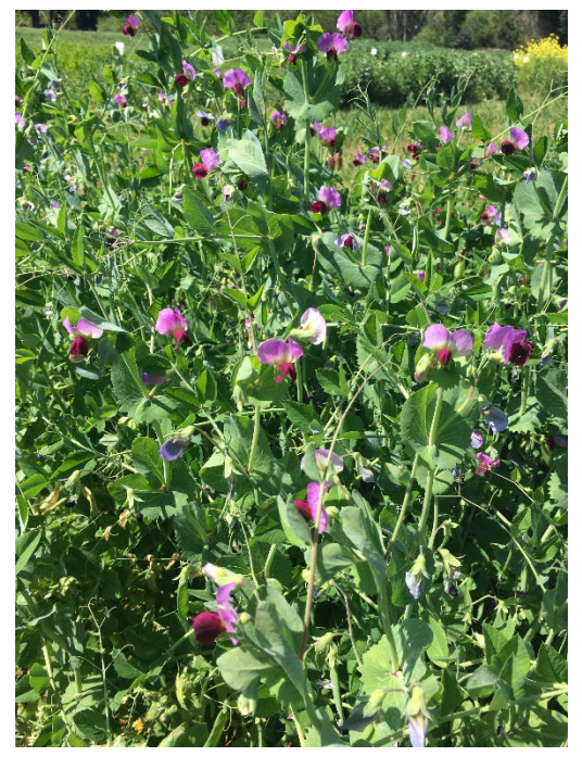
Field pea (Dundale), Lockeford PMC.