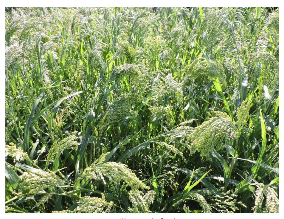
Proso millet, Lockeford PMC.

https://plants.usda.gov/home/plantProfile?symbol = PAMI2