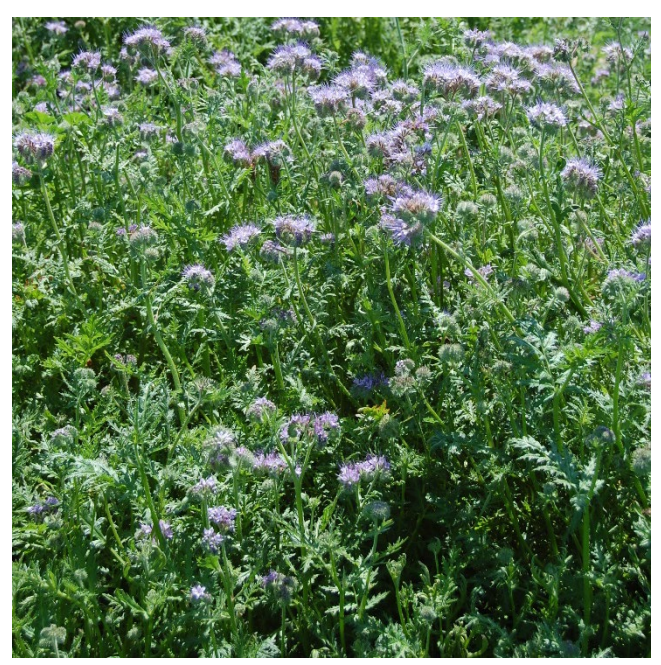
Lacy Phacelia, Lockeford PMC.

<u>UC SARAP Cover Crop database</u> <u>Lacy phacelia - Phacelia tanacetifolia Benth.</u>