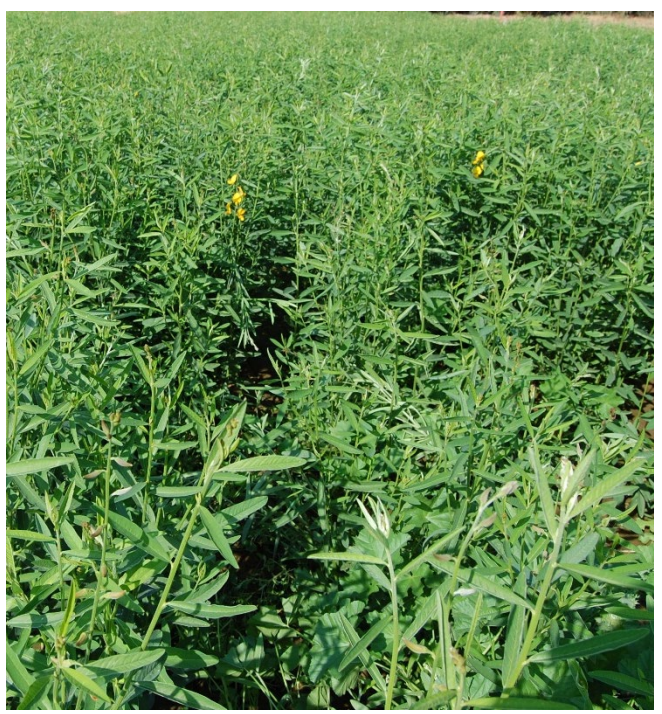
Sunnhemp (Tropic Sun), Lockeford PMC.