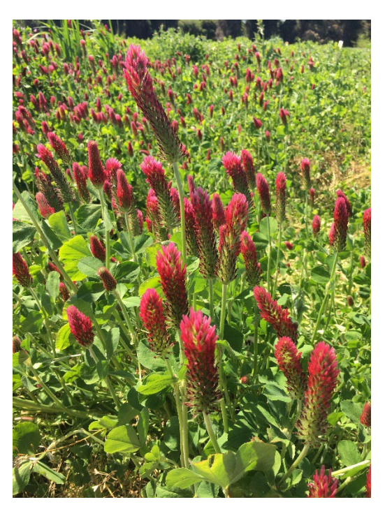
Crimson clover, Lockeford PMC.

<u>Plant Guide for Crimson Clover</u> (<u>Trifolium incarnatum</u>) <u>UC SARAP Cover Crop database</u>