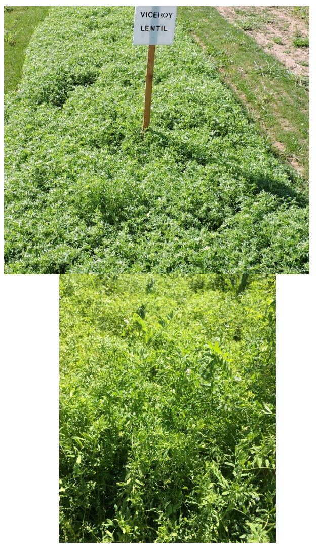
Lentil (Viceroy), Lockeford PMC.

<u>UC SARAP Cover Crop database</u> <u>https://plants.usda.gov/home/plantProfile?symbol=L</u> ECU2