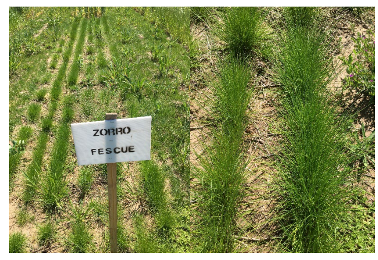
Annual fescue (Zorro), Lockeford PMC.