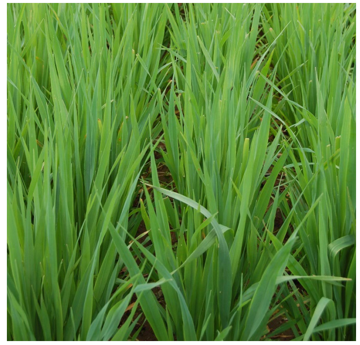
Oats (Cayuse) 120 days after planting, Lockeford PMC.