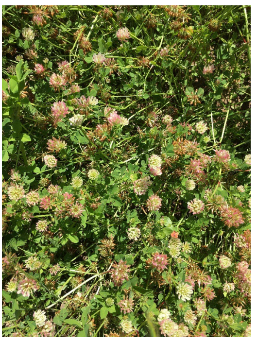
Balansa clover (Frontier), Lockeford PMC.

Balansa clover: cover crop for no-till systems