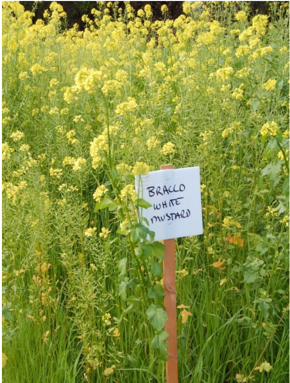
White Mustard (Bracco), Lockeford PMC.

<u>UC SARAP Cover Crop database</u> http://covercrops.cals.cornell.edu