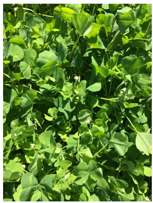
Subterranean clover (Antas), Lockeford PMC.