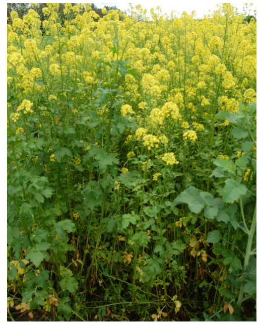
Common mustard, Lockeford PMC.