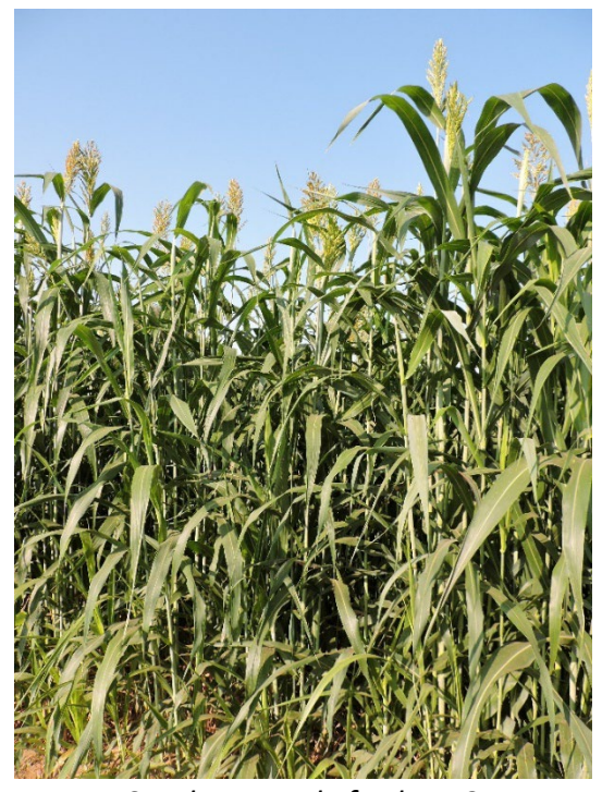
Sorghum, Lockeford PMC.