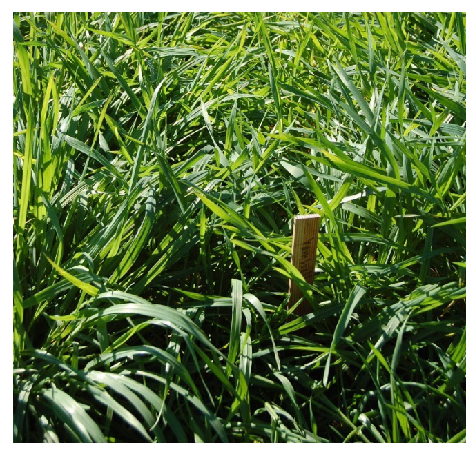
Wheat (Yamhill) 120 days after planting, Lockeford PMC.