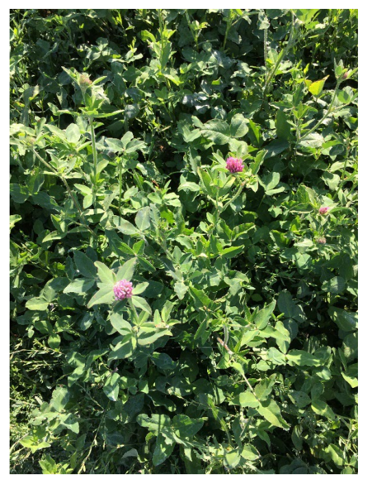
Red clover, Lockeford PMC.

https://plants.usda.gov/home/plantProfile?symbol=T RPR2