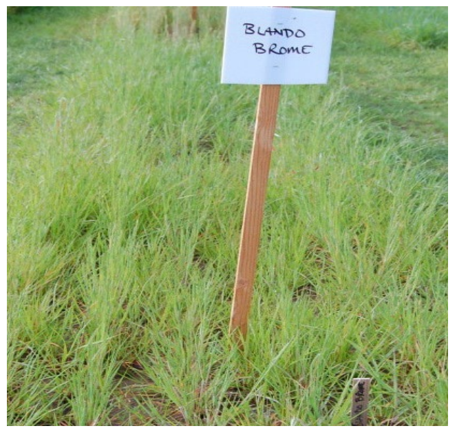
'Blando' soft brome, Lockeford PMC.