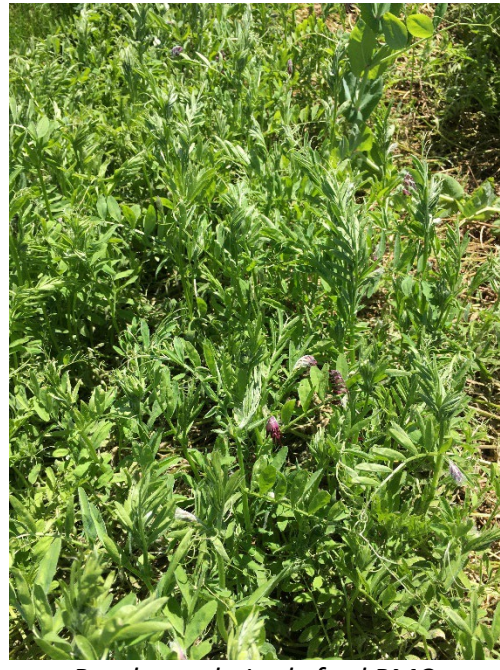
Purple vetch, Lockeford PMC.