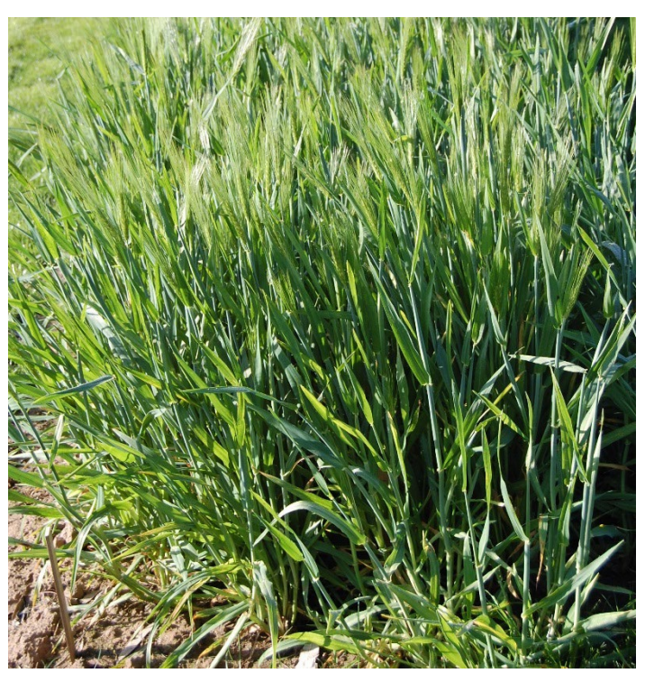
Barley (UC 937) 150 days after planting, Lockeford PMC.

UC-SAREP cover crop database barley Barley Plant Guide