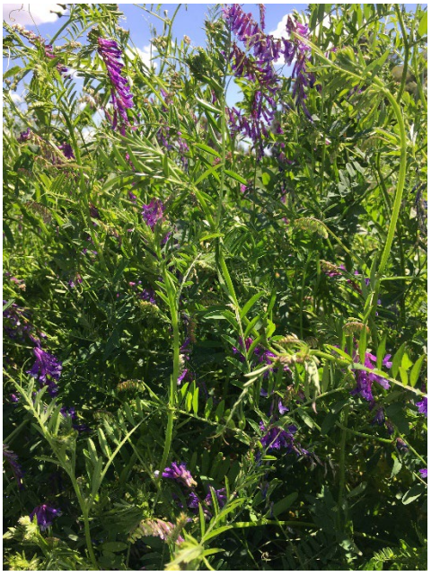
Woollypod vetch (Lana), Lockeford PMC.