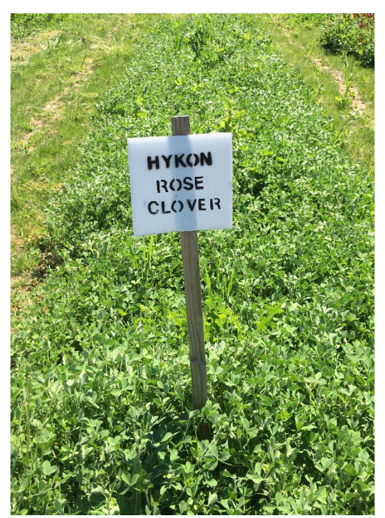
Rose clover, Lockeford PMC.