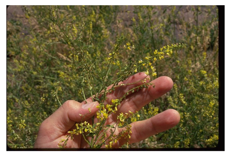
Sweetclover SARE – Agriculture Sustainability Institute at UC Davis, CA.