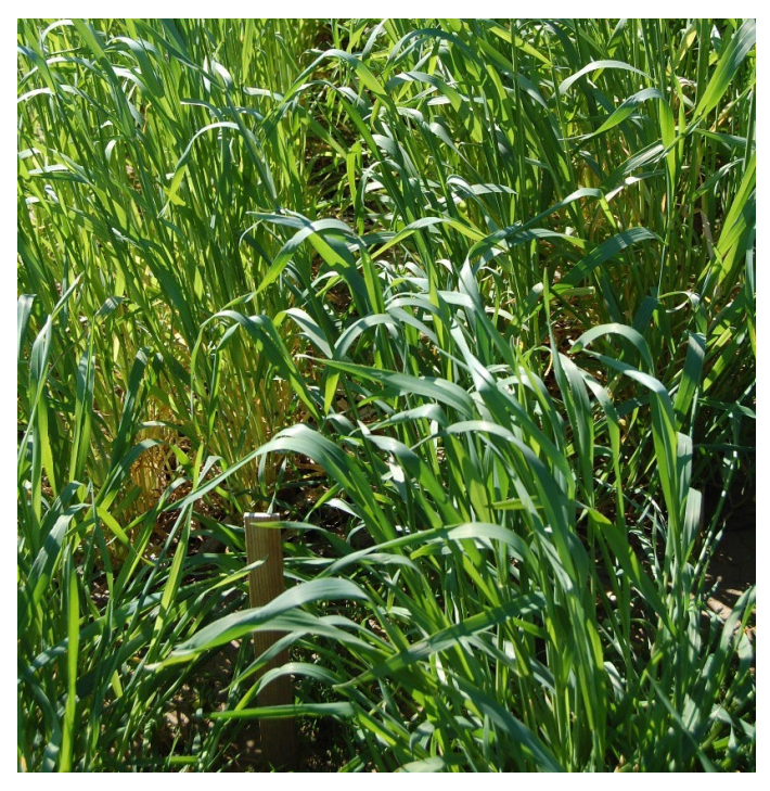
Cereal rye (Merced) 120 days after planting, Lockeford PMC.

<u>Plant Guide for Cereal Rye (Secale cereale L.)</u> <u>UC SARAP Cover Crop database</u>