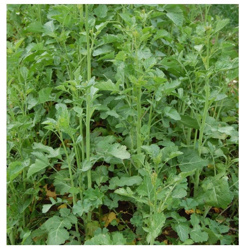
Brown mustard (Nemfix) 135 days after planting, Lockeford PMC.

<u>UC SARAP Cover Crop database</u> <u>http://covercrops.cals.cornell.edu</u>