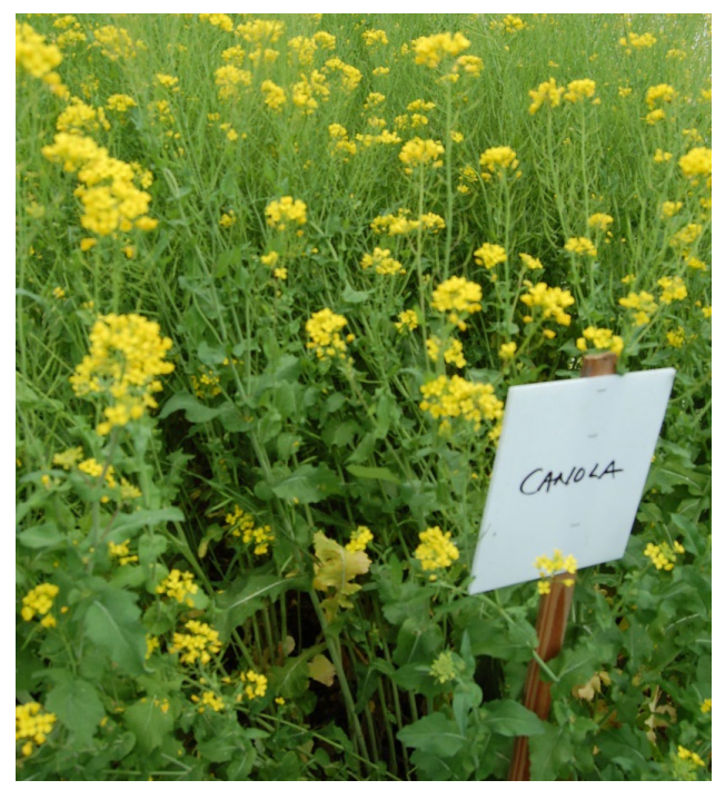
Canola at Lockeford PMC.