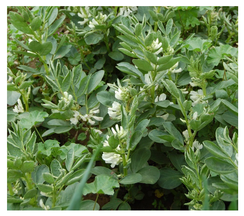
Bell bean, Lockeford PMC.