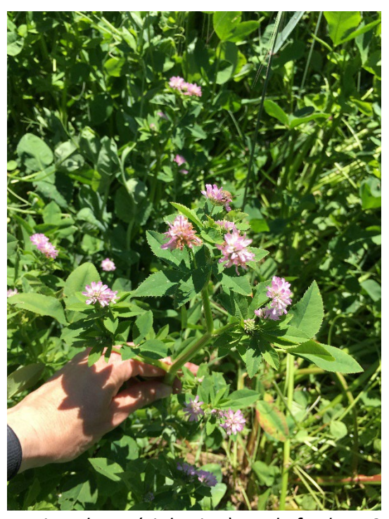
Persian clover (Lightning), Lockeford PMC.