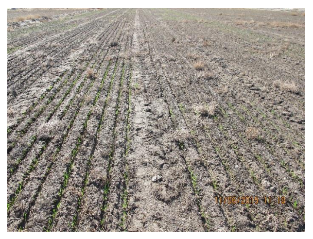
Drill rows of demonstration plots with emerging cover crops 16 days after planting into a stale seedbed using a cone seeder on a no-till drill.

This late fall trial will test winter hardiness of the cover crop cultivars. A second, identical trial will be planted into the same field next spring, beside the fall trial, to test summer survival and drought hardiness. Survivors of both the fall-planted and spring-planted trials will be rated for their ability to suppress weeds and for their general productivity.