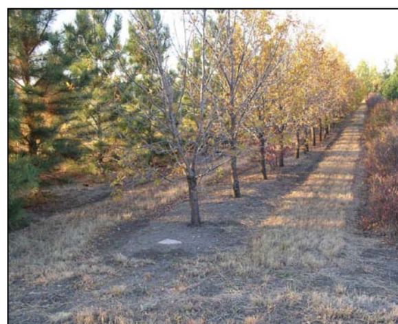
When fabric is not used, weed control can be handled by tillage (hand hoeing or rotary tree cultivation), mulch, or herbicides. Glyphosate works well when trees are larger and not as sensitive to herbicide drift.