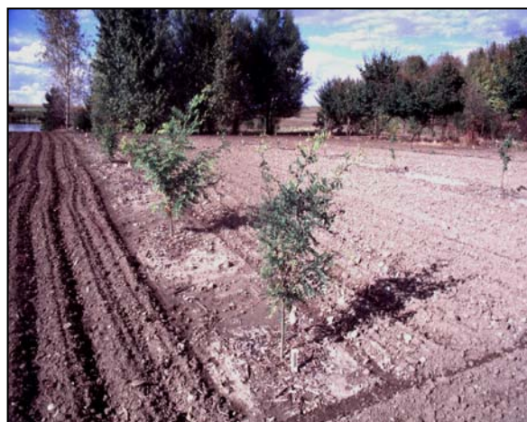
Frequent tillage may cause soil erosion.

Fabric Mulch Plantings: Seeding warm-season grass between the fabric strips soon after tree planting is desirable to prevent weed competition, especially from invasive species such as Canada thistle and wormwood. Tillage is also an option, but care must be taken to prevent pulling up the edges of the fabric.