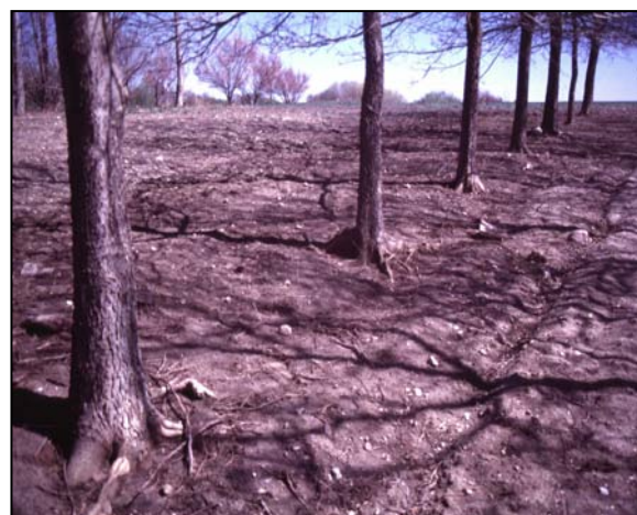
Tree roots can be damaged by tillage and erosion.