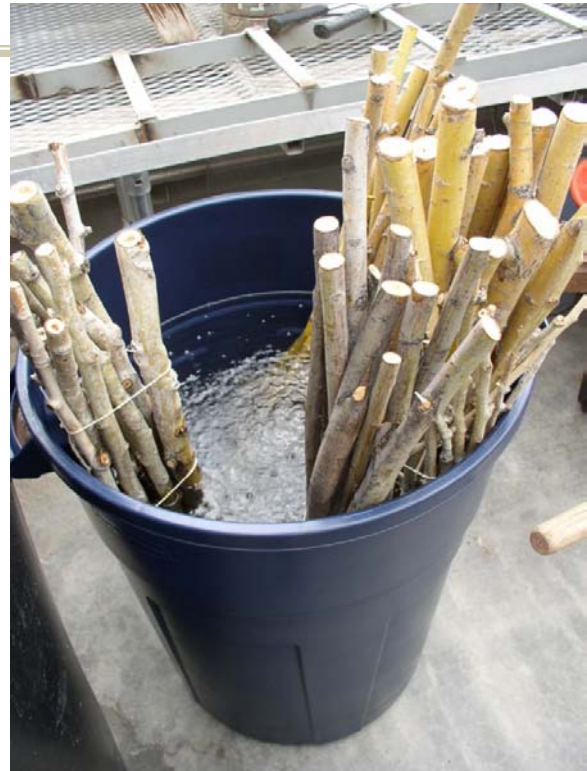
Dormant willow cuttings soaking in a water filled garbage can . Soaking cuttings for 7 to 14 days helps prime the cutting with water and initiate root growth for better establishment.