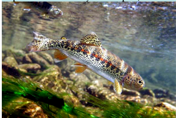
Native fish benefit from the food and habitat created by riparian buffers.