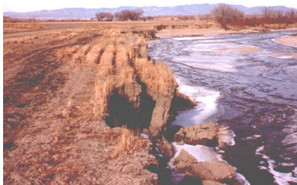
Cropland eroding into a stream. This field could have been protected with a properly managed riparian buffer.