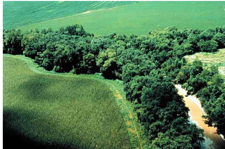
A healthy riparian buffer between cropland and a river system

Cropland fields shouldn't be planted right up to a stream's edge where the soil is generally more fragile and subject to erosion.