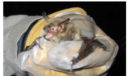
Red Bat.

The Rhodes family has owned and actively managed their 251 acres of woodlands for over 50 years. They have worked with various foresters to promote sustainable forest management practices on their land like planting and pruning trees, controlling grapevines and non-native invasive plants, and making timber stand improvements. Their latest project was to mechanically treat maple, beech and other undesirable tree species directly competing with oak and hickory seedlings. Essentially, this treatment mimics the effects of prescribed fire. The work was completed in 2017 by Ted Rhodes and his sons, with the assistance from consulting foresters Chad Hammond and Tom McDonald. This is one example of how woodland owners in southeastern Ohio can help keep oak on the landscape for future generations to enjoy.