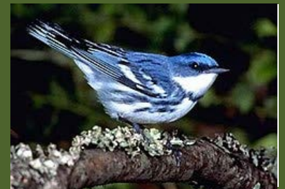
Cerulean Warbler.

Reduced wildfire threats: More than 5,400 acres across the Wayne National Forest were treated with controlled burns to support native oak trees while reducing wildfire threats to communities and landowners.