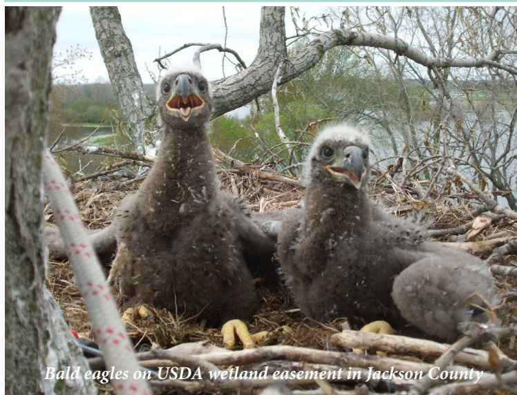
Bald eagles on USDA wetland easement in Jackson County

The USDA has targeted $816,000 for wetland reserve easements in the St. Joseph Watershed which includes portions of Michigan and Indiana. This funding is available through the St. Joseph River Watershed Conservation Partnership Project, funded through the USDA Regional Conservation Partnership Program.