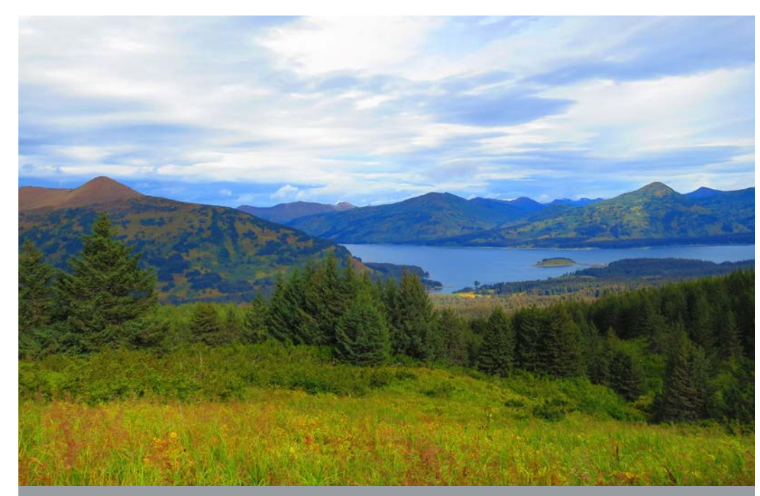
USDA's Natural Resources Conservation Service offers voluntary Farm Bill conservation programs that benefit agricultural producers and the environment.