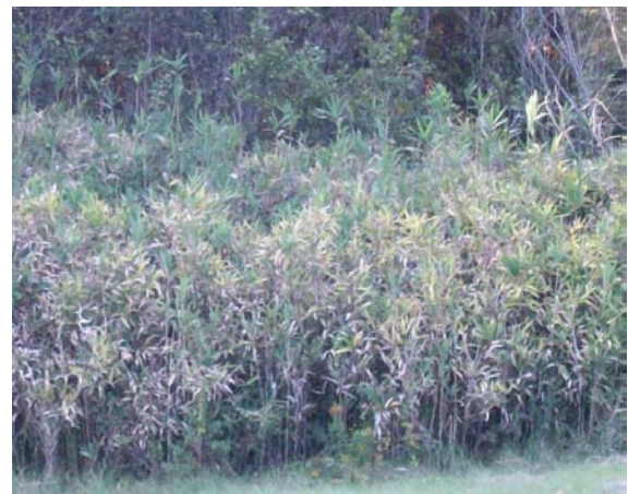
Figure 2. Stand of giant cane ( Arundinaria gigantea ). Photo taken on tribal lands of the Mississippi Band of Choctaw Indians, taken by Timothy Oakes, 2011.

hunting squirrels, rabbits, and various birds (Bushnell 1909; Hamel and Chiltoskey 1975; Speck 1941; Kniffen et al. 1987). Young Cherokee boys used giant cane blowguns armed with darts to protect ripening cornfields from scavenging birds and small mammals (Fogelson 2004). The Choctaw used the butt end of a cane, where the outside skin was thick, as a knife to cut meat, or as a weapon (Swanton 1931). Tribes of Louisiana made flutes, duck calls, and whistles out of cane (Kniffen et al. 1987). Cane is best harvested in the fall or winter (October to February) for blow guns and flutes, and plant stems, known as culms, are selected from mature, hardened off plants with larger diameters.