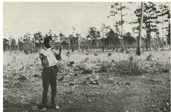
Figure 3. A Choctaw man demonstrating how a blowgun is positioned for shooting. The blowgun is about 7 feet in length and made of a single piece of giant cane. Photo by David I. Bushnell, Jr., 1909. Courtesy of the Smithsonian National Museum of Natural History, National Anthropological Archives.