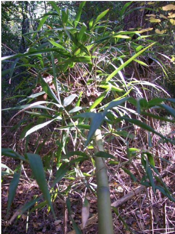
Figure 1. Giant cane ( Arundinaria gigantea ). Photo taken on tribal lands of the Mississippi Band of Choctaw Indians, taken by Tim Oakes, 2011.

Contributed by: USDA NRCS National Plants Data Team, Greensboro, NC