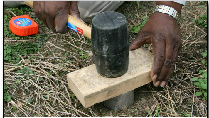
A three inch diameter ring is hammered into the soil to collect bulk density samples.

Dynamic - Bulk density is changed by crop and land management practices that affect soil cover, organic matter, soil structure, and/or porosity. Plant and residue cover protects soil from the harmful effects of raindrops and soil erosion. Cultivation destroys soil organic matter and weakens the natural stability of soil aggregates making them susceptible to damage caused by water and wind. When eroded soil particles fill pore space, porosity is reduced and bulk density increases. Cultivation can result in compacted soil layers with increased bulk density, most