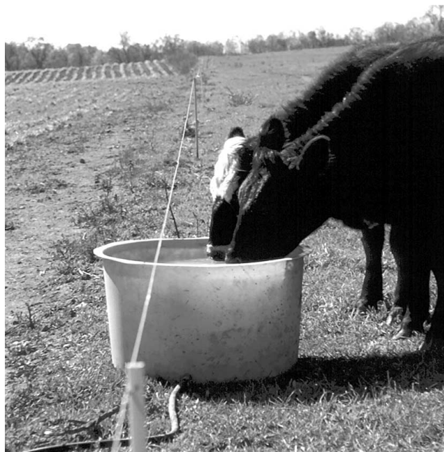
Figure 2. Most management-intensive grazing systems make use of lightweight portable poly tanks. With quick disconnects, they can be easily carried from paddock to paddock.

Small (lightweight) UV-stable, high-density polyethylene portable tanks (14 to 60 gallons) with float valves and quick couplers cost about $100 to $150 (Figure 2). These small tanks will water a large number of cattle if the animals are close to the tank and come singly or if the recharge rate is at least equal to the rate at which the cattle can drink the water (2 gpm times the number of cows that can drink from the tank at one time). Figure 3 shows a larger tank that can be used year-round with a