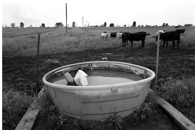
Figure 1. The majority of beef cattle are managed in pasture systems that depend on convenient waterers at several locations on the farm for maximum production efficiency.

Supplying water to each paddock may require a major investment in pumps, piping and tanks. To maintain the highest water quality, unlimited access to streams should be evaluated. In some situations, it may be desirable to limit stream access for drinking and to protect the access points by hard surfacing. An alternative is to fence off the streams and pump water to tanks.