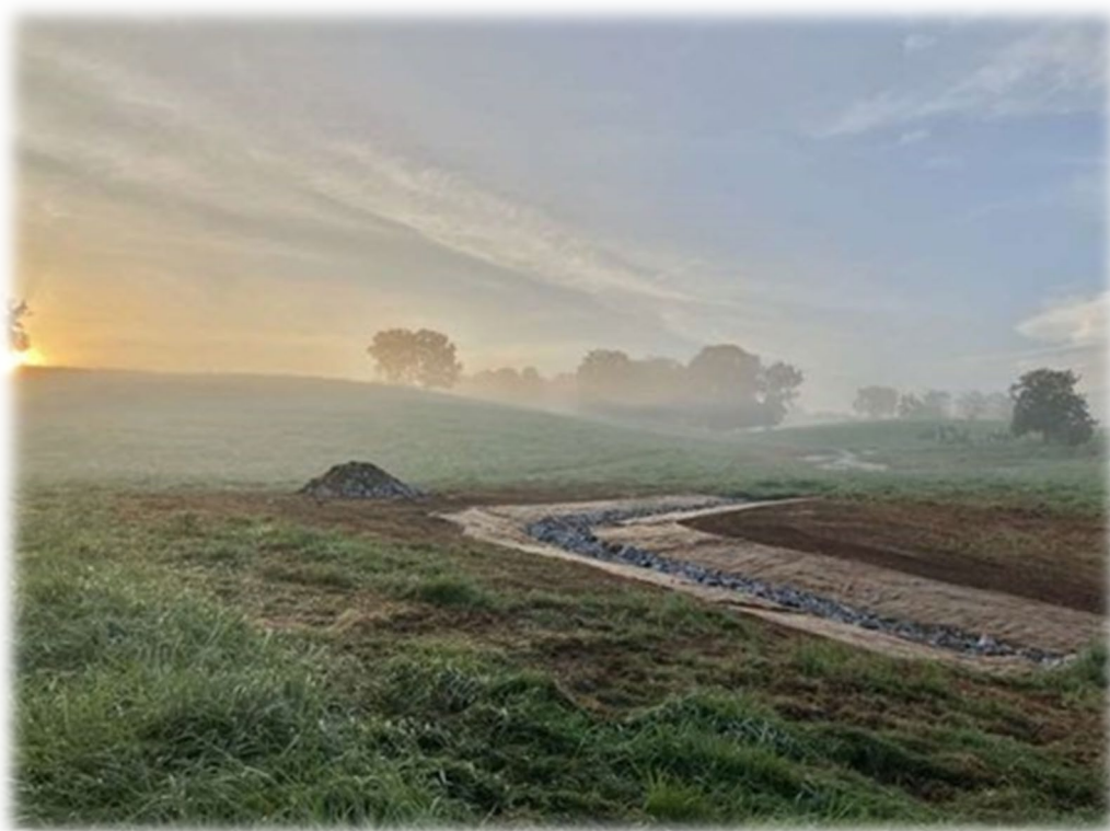
Rock lined waterway on a 319 project in the Bat Creek Watershed