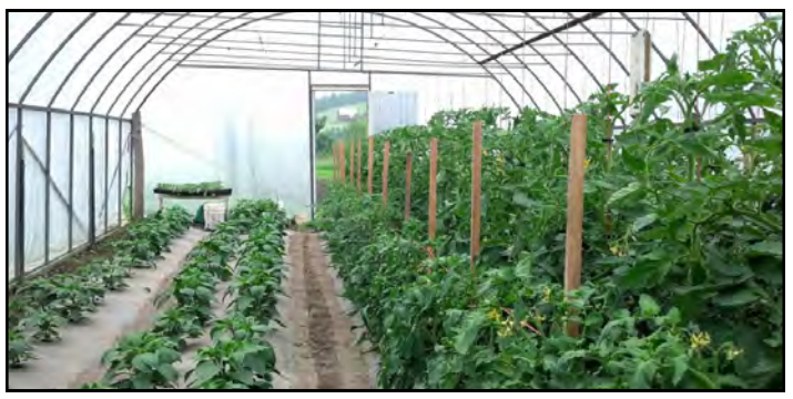
Pepper transplant spacing on left and trellised tomatoes on right