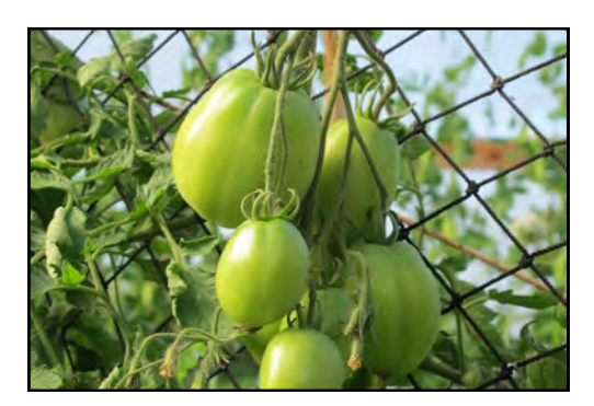
Tomatoes growing in a Homer, Alaska high tunnel. The tomatoes have been trellised against string mesh

◆ Any nutrients material should be tilled into top 4 to 6 inches of your tomato bed before transplanting.