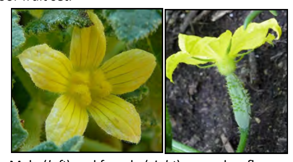
Male (left) and female (right) cucumber flowers

Since each cucumber flower is open only one day, pollination is a critical aspect of cucumber production. One or more pollen grains are needed per seed, and insufficient seed development may result in fruit abortion, misshapen, curved or short (nubbin) fruit, or poor fruit set.