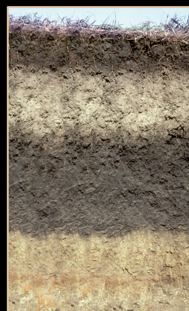
6 These soils formed in silty material deposited by floodwaters onto flood plains and into upland drainageways. The soils are moderately deep over a buried soil. The buried soil had a dark surface horizon that was covered by fresh sediments.