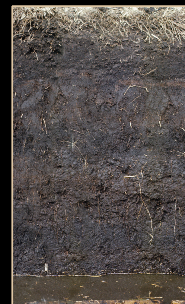
10 These soils consist of very deep organic deposits in freshwater marshes. They are in areas of flatwoods and lowlands that are very poorly drained and have a high water table. Organic materials accumulated under anaerobic conditions in areas where decomposition was very slow.

The first impression we have when looking at bare earth, or soil, is of the color. Vivid colors and striking differences can catch our eye. The stories told by soil colors vary with the ecosystem and other factors. Soils come in many different colors, most commonly in shades of black, yellow, brown, red, gray, and white.