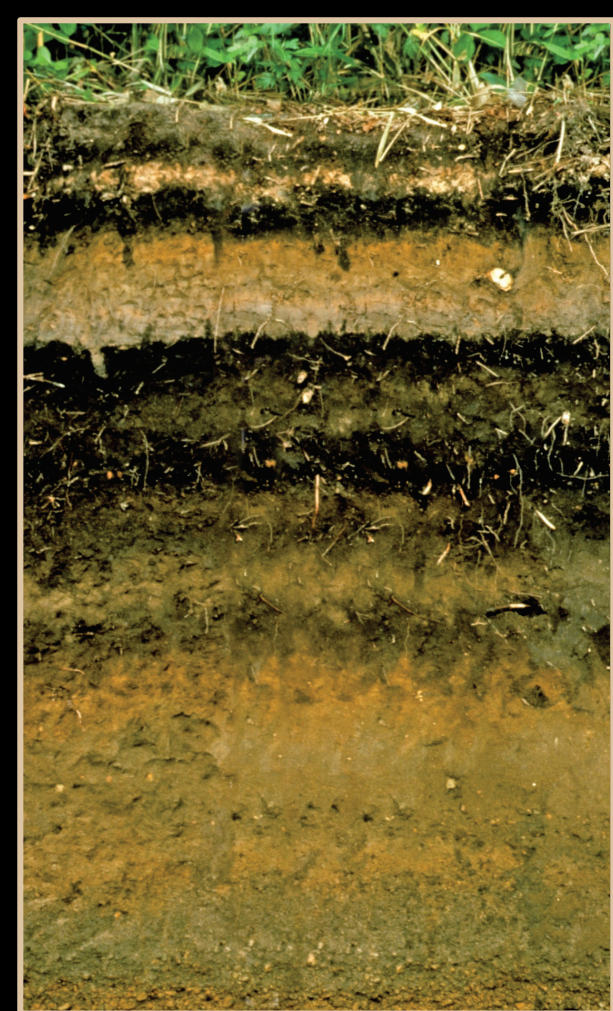
1 These soils formed in volcanic ash. They include weakly weathered soils that contain significant amounts of volcanic glass. They also include more strongly weathered soils. The content of volcanic glass is one characteristic used in classifying these soils.