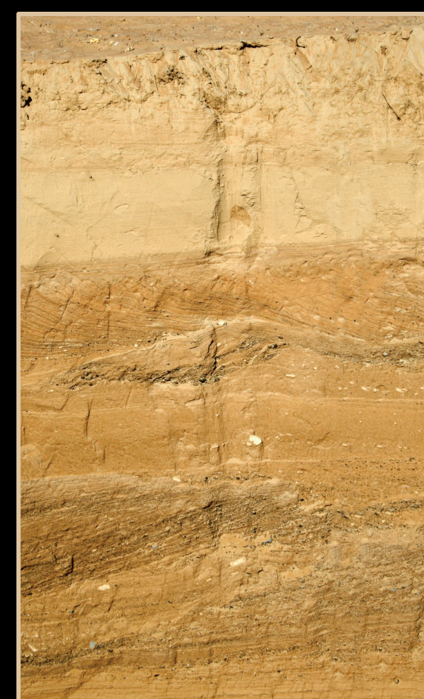
4 These soils formed in wind-deposited sandy material that originated from erosional deposits along rivers. Wind blew the sand out of the areas along rivers, forming sand dunes and creating layers of deposits in the soil. The dominant sand mineralogy is quartz.