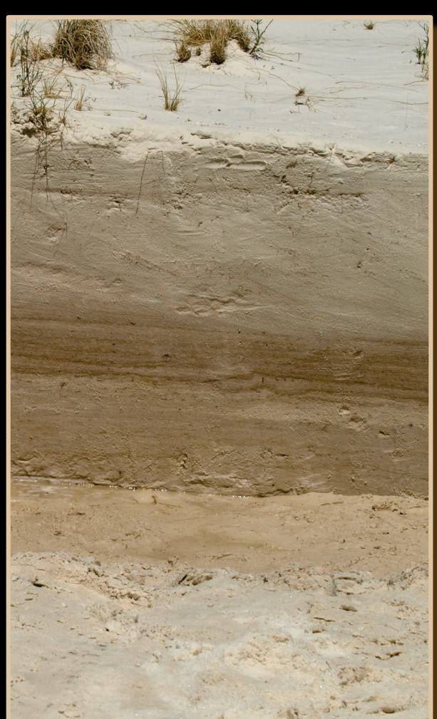
3 These soils formed in wind-deposited sandy material that contained gypsum. The soils are nearly level and are in interdune areas, on low dunes, and along relict shorelines in dune fields.