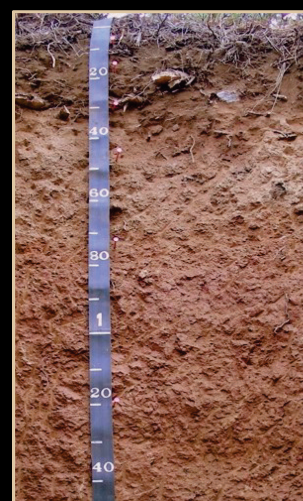
2 These red soils have large amounts of secondary iron oxides, such as hematite. Located in foothills, these intensely weathered soils are derived from iron-rich parent rocks, such as basalt, greenstone, gabbro, serpentinite, and mafic phases of granitic rocks.