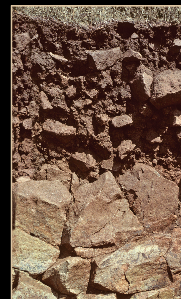
8 These soils consist of very shallow and shallow, well drained and somewhat excessively drained soils that formed in material transported from a slope by water, material that accumulated at the bottom of a slope, and material that weathered from schist, gneiss, and granitic rocks. The soils are on mountain slopes, ridges, structural benches, and spurs, commonly on northern aspects.