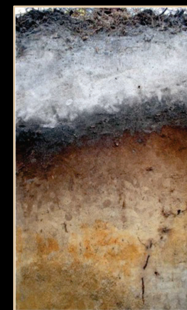
9 These soils formed in sandy marine sediments on the Atlantic and Gulf Coastal Plain. They are in areas of flatwoods, in depressions, in low areas on uplands, on stream terraces, and in tidal areas.