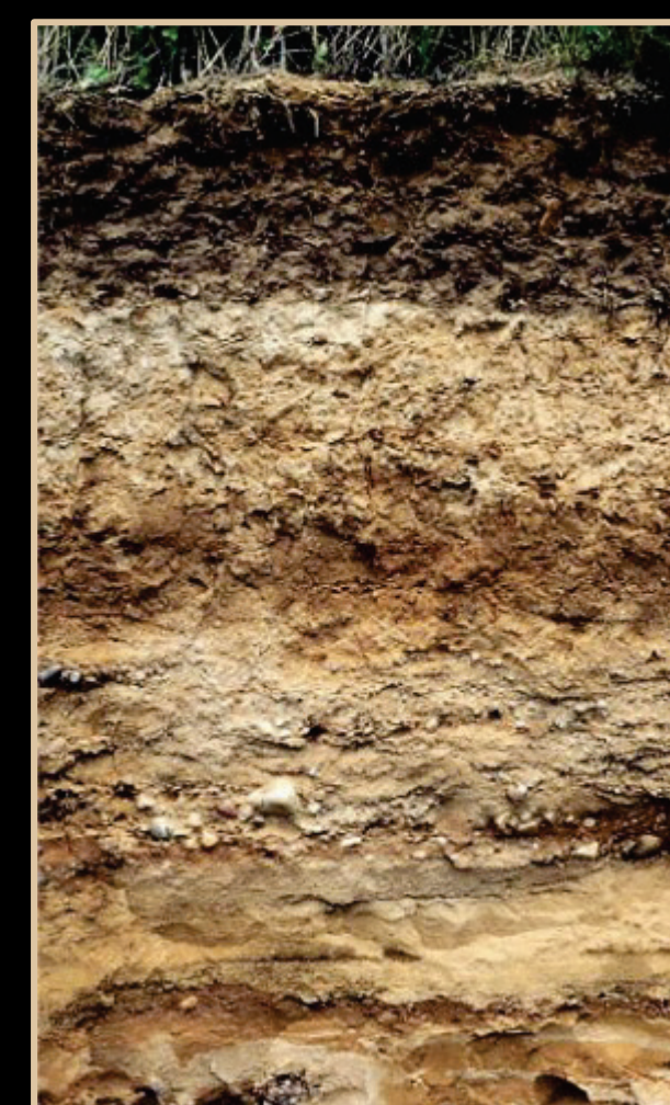
5 These soils formed where strong winds and glacial meltwaters deposited 2 to 3 feet of silty loess and loamy outwash on top of sand and gravel. The soils, which developed in areas of northern hardwood forests, have an organic-enriched surface layer and a clay-enriched subsoil.