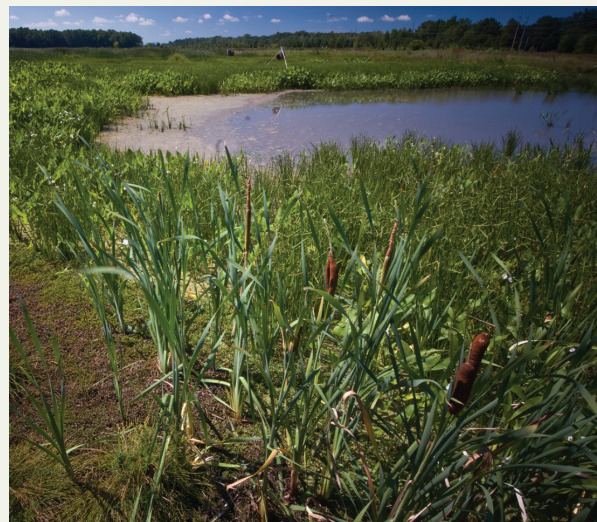
Restoring wetlands can help provide vital habitat for black duck and many other species.