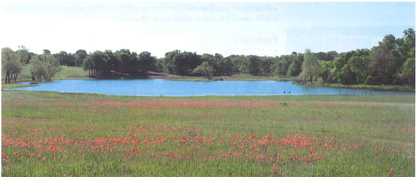
Upper Clear Boggy Watershed Dam No. 33 is part of a 113,482-acre watershed.

USDA, NRCS 100 USDA, Suite 206 Stillwater, OK 74074 (405) 742-1204 www.ok.nrcs.usda.gov