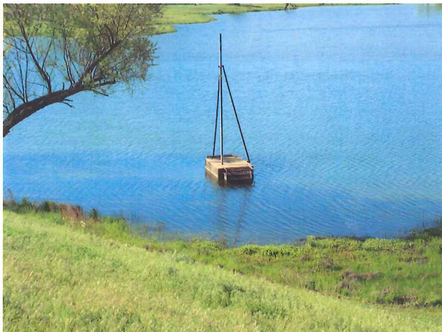
Existing principal spillway inlet on Upper Clear Boggy Watershed Dam No. 33.

Rehabilitation of the dam will reduce the potential for loss of life and provide $5.2 million in flood-reduction benefits over the dam's 100-year life. It will benefit 175 floodplain acres.