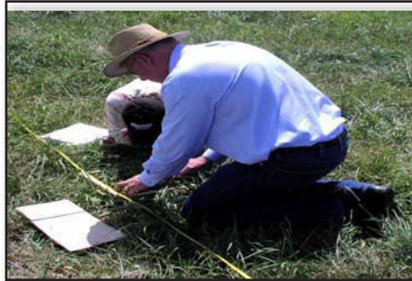
PLT02 – Monitor Key Grazing Areas to Improve Grazing Management.