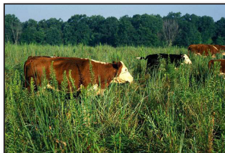
ANM09 – Grazing Management to Improve Wildlife Habitat.