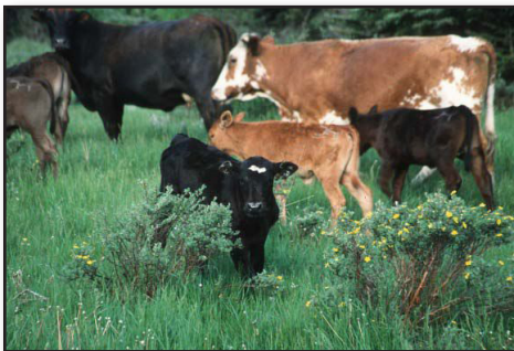
ANM26 – Managing Calving to Coincide with Forage Availability.