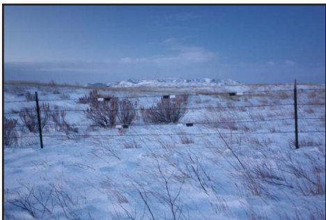
ANM27 – Wildlife Friendly Fencing.

National Web Page for CSP Enhancements Activity Job Sheets