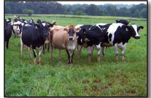
WQL19 – Transition to ORGANIC Grazing Systems.