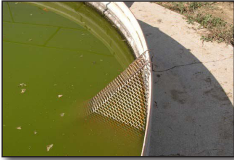
ANM38 – Retrofit Watering Facility for Wildlife Escape and to Enhance Access for Bats and Bird Species