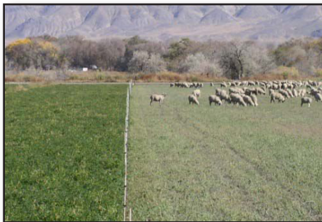
PLT16 – Intensive Management of Rotational Grazing.

And, there are many more! Visit your local NRCS office or go online to use the following resources: