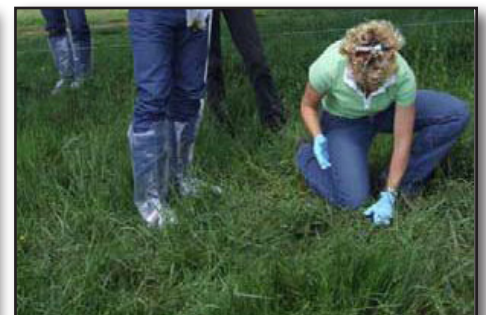
ANM17 – Monitoring Nutritional Status of Livestock Using the NUTBAL PRO System.