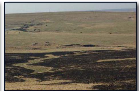
ANM11 – Patch-burning to enhance wildlife habitat