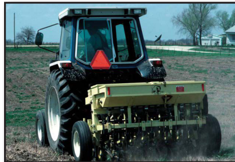
ANM03 – Incorporate Native Grasses and/or Legumes to 15 Percent or more of Herbage Dry Matter Productivity.

SQL - Soil Quality Enhancement WQL - Water Quality Enhancement WQT - Water Quantity Enhancement