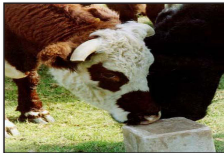
WQL03 – Rotation of Supplement and Feeding Areas.