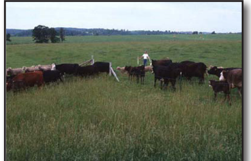
WQL18 – Non-Chemical Pest Management for Livestock.