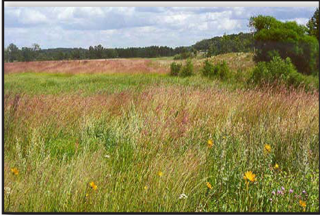
ANM21 – Prairie Restoration for Grazing and Wildlife Habitat.