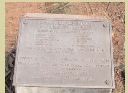
Markers like this one were a common sight in the 1960's

Since 1953, 357 project dams have been built in Georgia. The Georgia Safe Dams Program has categorized 150 of these as "High Hazard," indicating a potential loss of life if the dam were to fail. Preliminary investigations indicate that some $120 million will be needed to upgrade these structures and ensure compliance with current dam safety legislation.