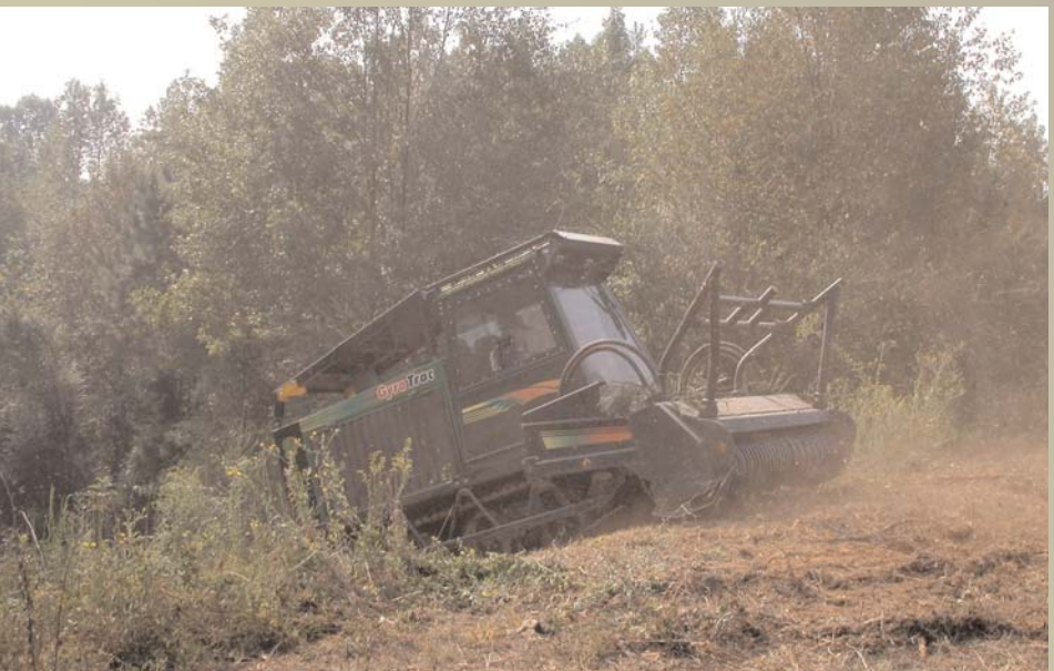
The gyro-tech is a unique machine that can mulch trees. What used to take weeks can now be done in hours