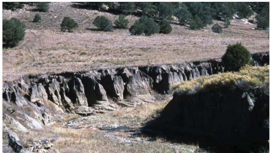
This gully erosion in the Trinidad Lake North Watershed will be addressed by the project.

When this project is complete, the benefits will include reduced erosion of agricultural land and sediment deposits in Trinidad Lake, improving grazing values, and significant habitat improvement for the Trinidad Lake shery.