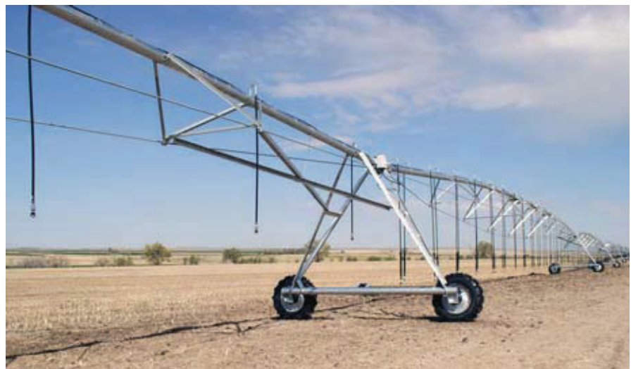
Installation of a Low Energy Sprinkler System increases the efficiency of water use.

Funded through the American Recovery and Reinvestment Act (ARRA) of 2009, this project is part of the Obama Administration's plans to modernize the nation's infrastructure, jump-start the economy, and create jobs. NRCS is using Recovery Act dollars to update aging flood control structures, protect and maintain water supplies, improve water quality, reduce soil erosion, enhance fish and wildlife habitat, and restore wetlands. NRCS acquires easements and restores floodplains to safeguard lives and property in areas along streams and rivers that have experienced flooding.