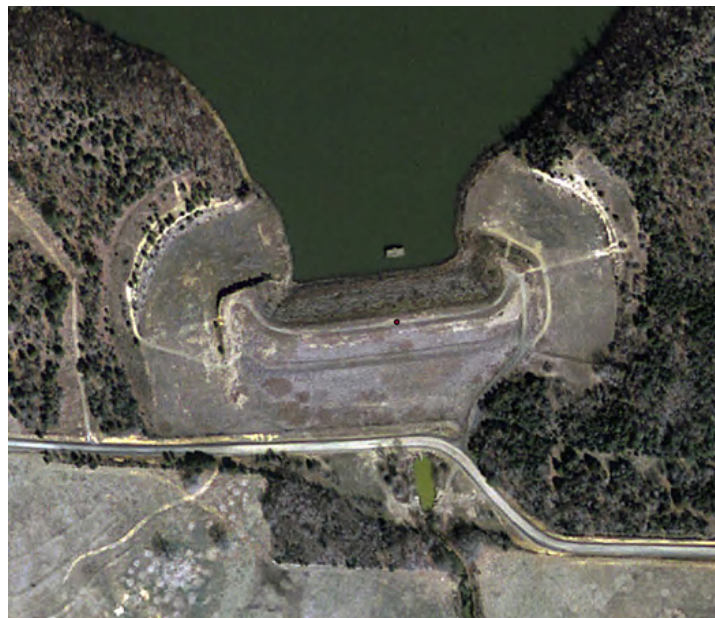
An aerial view of Site 9 of the Upper Petit Jean Watershed dam west of Booneville, Arkansas.

Funded through the American Recovery and Reinvestment Act (ARRA) of 2009, this project is part of the Obama Administrations plans to modernize the nations infrastructure, jump-start the economy, and create jobs. NRCS is using Recovery Act dollars to update aging flood control structures, protect and maintain water supplies, improve water quality, reduce soil erosion, enhance fish and wildlife habitat, and restore wetlands. NRCS acquires easements and restores floodplains to safeguard lives and property in areas along streams and rivers that have experienced flooding.