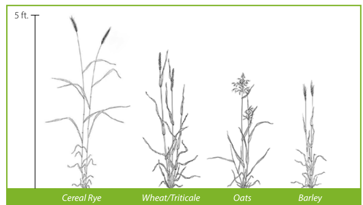
Cover crop grass growth comparison