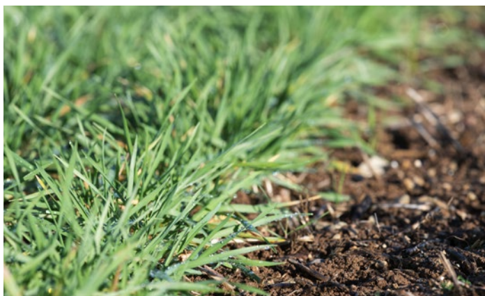
Drilled barley grows in an Iowa crop field.