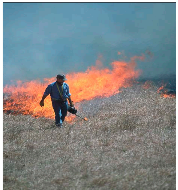
Figure 2 Fire can be used in many settings to encourage forbs that feed and shelter pollinators

State offices also can choose to offer landowners the opportunity to apply for funding to pay a technical service provider to supply guidance under the EQIP conservation practice conservation activity plan (CAP). CAPs address specific conservation needs, including pollinator habitat enhancement (CAP 146). To be most useful, completed CAPs