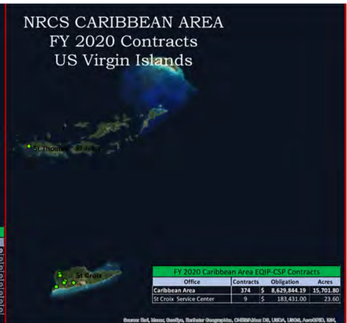
Number and amount of obligated CSP and EQIP contracts in FY 2020 by Field Office and territory.